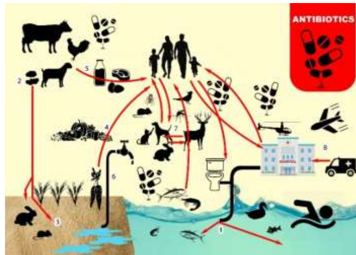
Figure 1. Summary of the pathways of transmission of resistant bacteria between animals, humans and the environment.